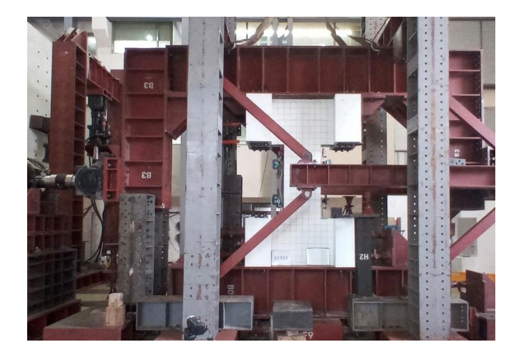
Fig. 2 Test set-up for coupling beam

actuator. Three load cycles were applied to the specimen at the drift-ratio of 0.25, 0.375, 0.5, 0.75, 1, 1.5, 2, 3, and 4%.